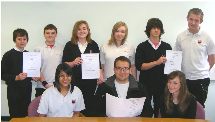
Members of the School Council receiving copies of the report

We are also proud of the identification of so many outstanding and excellent features, and this booklet brings together some of the headline comments from the report.